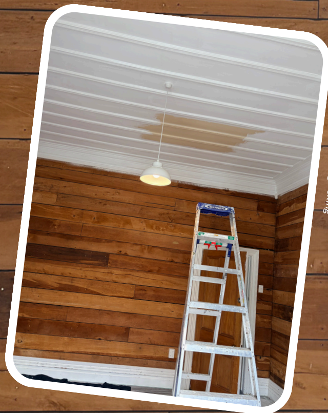
Image: The offending ceiling

As I eased into the new year, that little domestic parable stayed with me. In Whānau Mercy Ministries we are blessed by a model that is intentionally collegial, shared, and relational. Ministerial public juridic persons (MPJP), our formal structure in Church terms, are designed so that no one carries the load alone. Decisions are discerned together. Wisdom is held in community. Strength comes from collaboration, not heroic individual effort. The WMM strategic priorities include Strengthening Whānau Mercy — in part as a way to foster and develop this very sense.