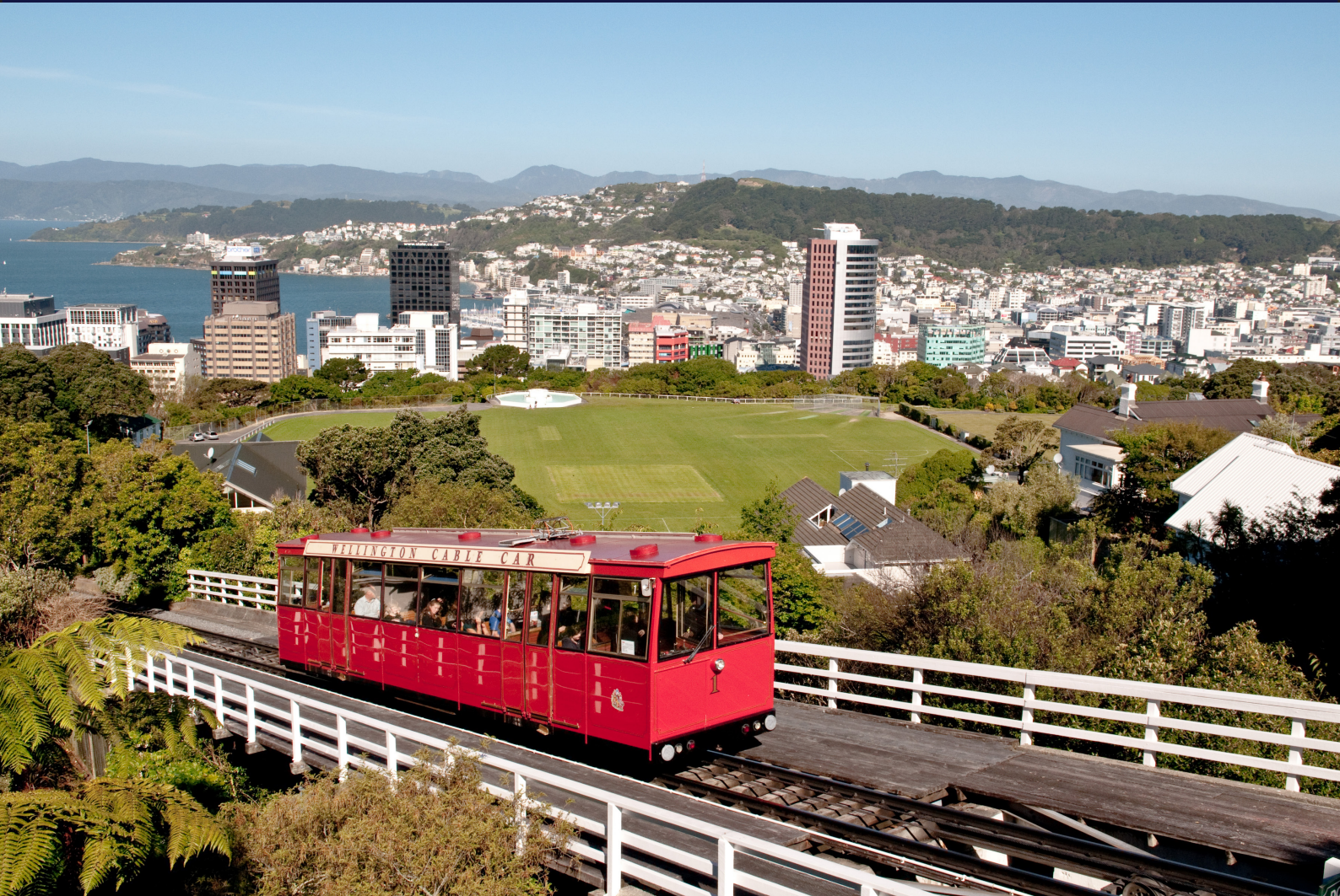
Wellington Cable Car