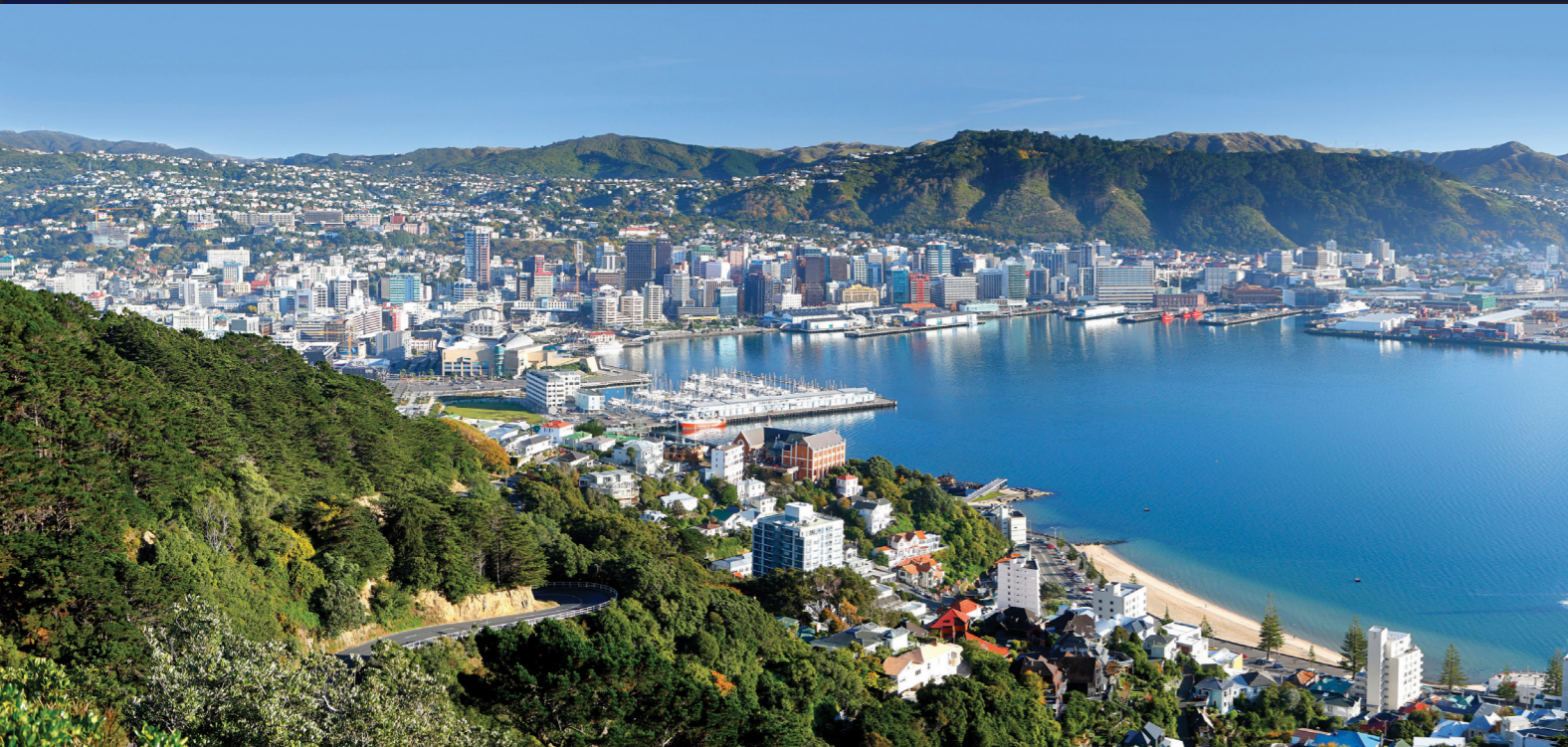
Te Whanganui-a-Tara - Wellington

Atawhaingia ō tātau kāinga is therefore more than a theme — it is a call to gather, to reflect, and to lead with mercy and faith in every place we stand.